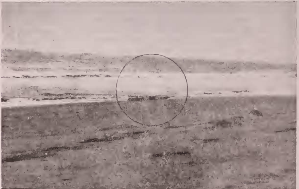
Photo. 1. Gharial on the coast.

As regards the point of entrance into the sea it is difficult to guess but the two possibilities are: through the Mahanadi delta at Paradip (40 km south-west of Gahirmatha) or through the Brahmani-Baitarani systems. This migration may be purely accidental and perhaps had taken place or commenced during the high flood in September last, and this movement cannot be compared with the seasonal movement of the Asian giant turtle Pelochelys bibroni which leaves the freshwaters